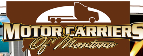
BECOME A MEMBER