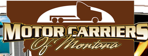
BECOME A MEMBER